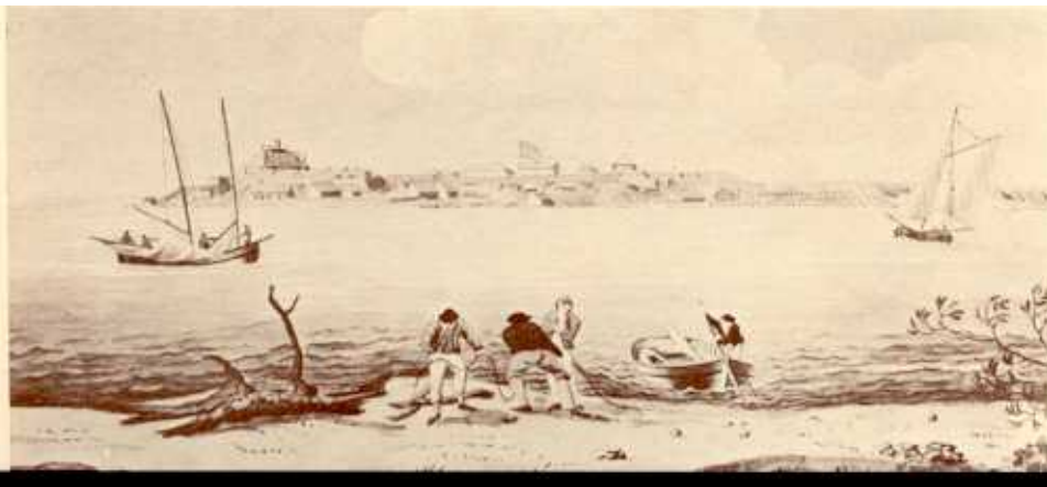
Fort Niagara, about 1803, as viewed from Fort George.

Further American crossings were opposed by the British battery at Vrooman's Point firing at boats crossing the river. However, it did not do much damage. By 2 o'clock in the afternoon some 700 or 800 of