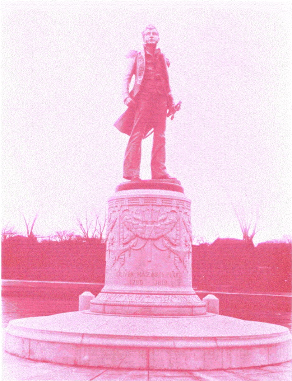
Statue of Oliver Hazard Perry erected in Front Park, 1915.