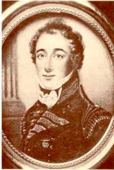
British General Sir Isaac Brock.

Van Rensselaer's troops had arrived on the Canadian side, and many more were in position to cross. Victory appeared to lie in American hands.