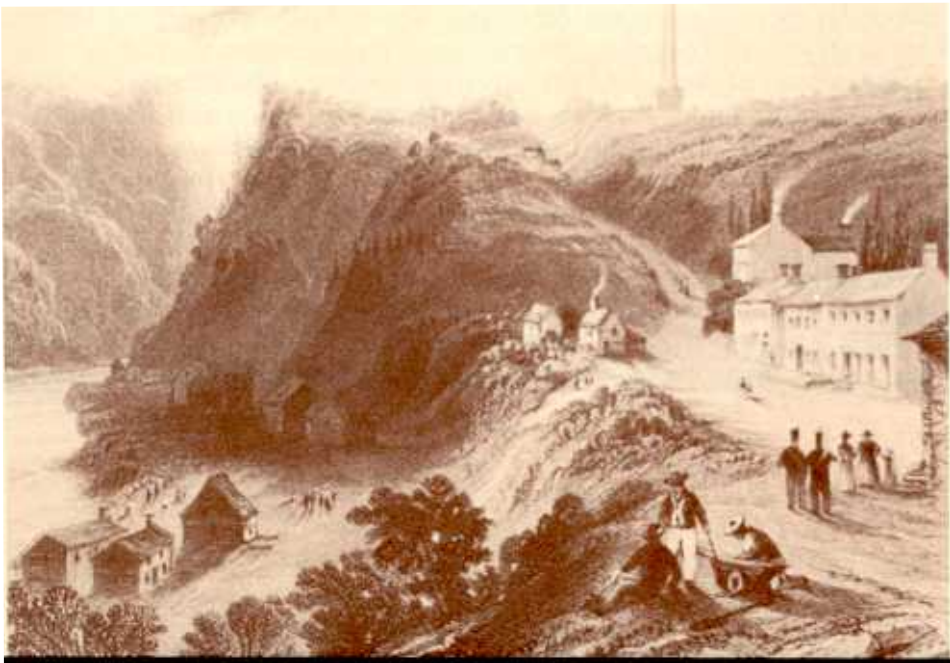
Queenston Heights showing Brock's Monument, as it appeared in 1840.

On the night of June 5, some 1,400 of the American troops camped on the Burlington-Niagara Road near the mouth of Stoney Creek on Lake Ontario. Lieutenant-Colonel Harvey, under Vincent's command, led a surprise attack on the American forces and drove them out