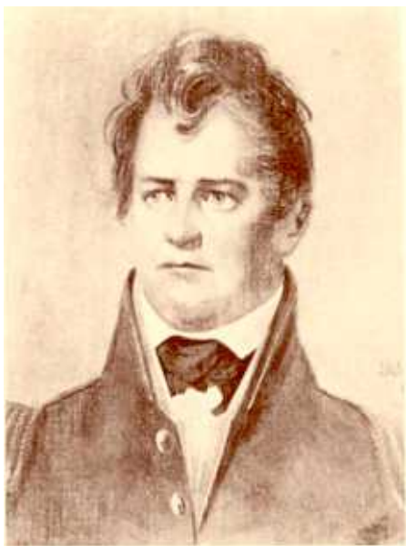
General Peter B. Porter.

determined to conquer the continent of Europe and to subdue England as well. England was fighting for self-preservation. Neither Napoleon nor the British Government had much concern for the rights of a weak neutral, such as the United States was at that time.